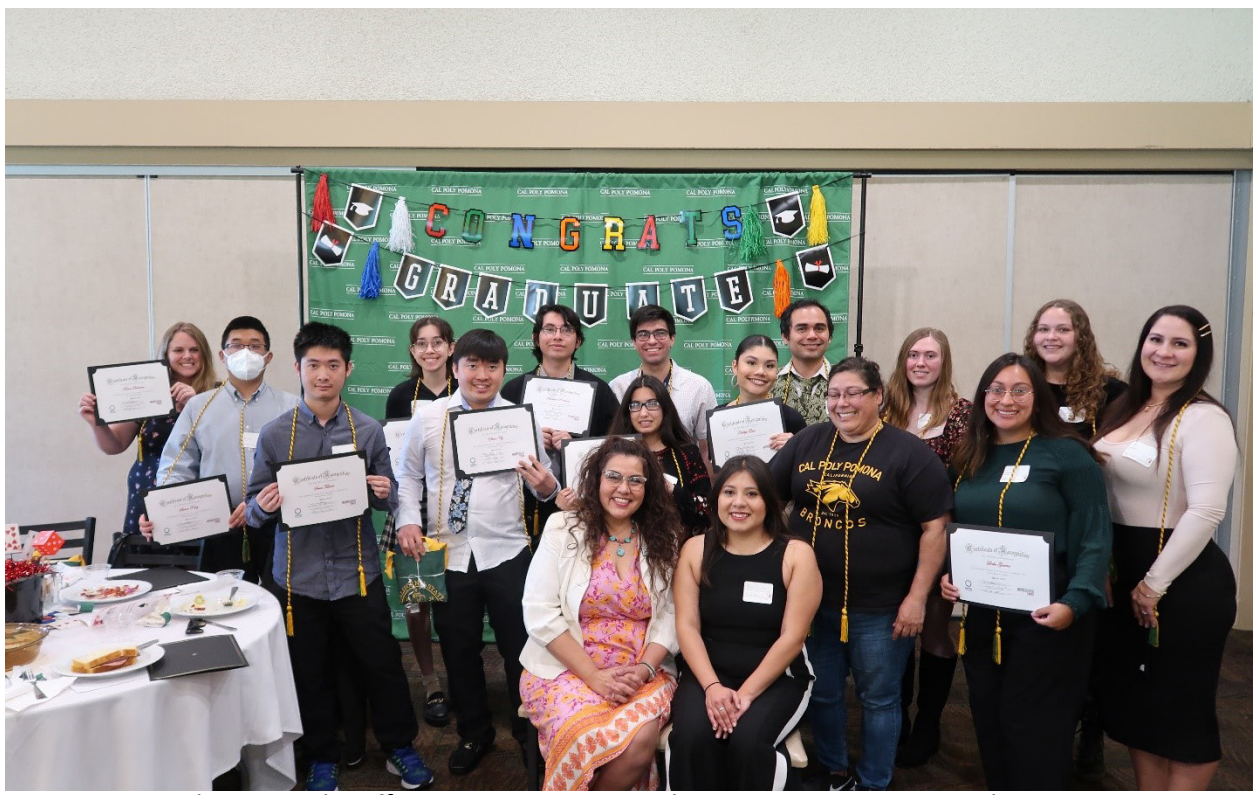
ARCHES graduates and staff at ARCHES 2023 Graduation Recognition Luncheon

Additionally, many of our students experience the stigma of being a person with a disability and seldom find a safe space to have candid conversations about their challenges. ARCHES strives to provide that safe space for our students and guide them through the sometimes overwhelming landscape of CPP, but also to empower them to develop strategies to succeed in their future.