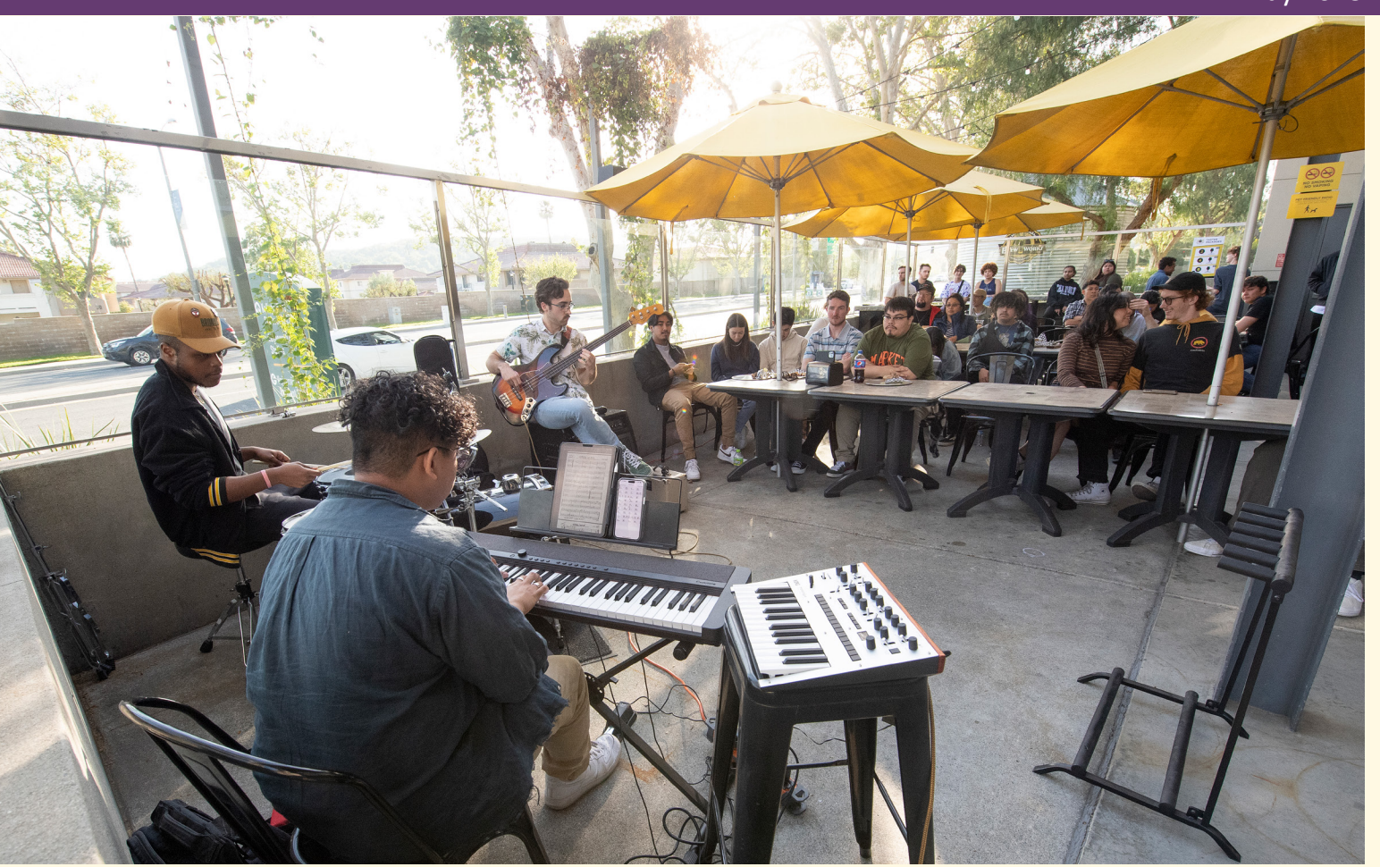
Innovation Brew Works turns 8! Read more on page 9